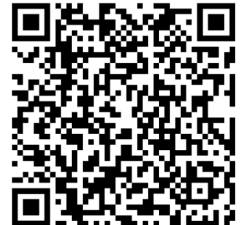
Program on the Move Schedule

Our FREE mobile programming is back for another year! Reserve a returning favorite or try out one of our new offerings. Schedule your program