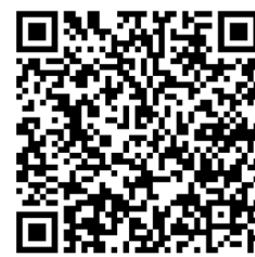
Board Approved Award Nomination Form