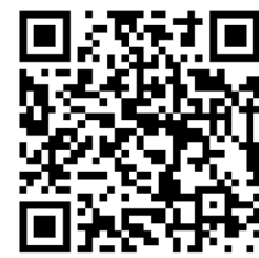
Board Approved Award Endorsement Form