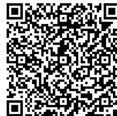
Appreciation and Recognition Handbook

The new map for Camp Country Center has been posted! Check it out.