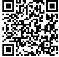
Product Program Champion Agreement

gsLearn for Fall Product went live on Wednesday, August 16th. All volunteers either at the Service Unit level or Troop level that had their Product Program Agreement and Membership Year 24 registered completed, are being uploaded to the modules.