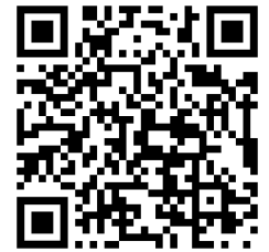
Family Product Program Agreement

Family Product Program Agreement Product Program Champion Agreement Juliette Product Program Agreement