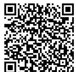
GSNETX gsEvents sneak peek

In this new platform, you will be able to see and register for other council's events, notify the members you're registering just by completing registration and look back at your event history from one place!