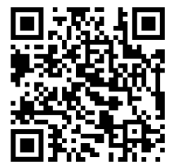
Juliette Product Program Agreement