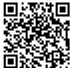
Girls in Action Form

How is your troop using their cookie proceeds this year? Are you taking a trip, going to an amusement park, completing a service project? We’d love to see your hard work paid off! Share your photos with us using the Girls in Action Form .