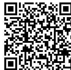
Learn with Luna Handout