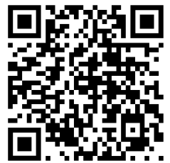
Volunteer Feedback Form

“What Can GSCB Do For You?”, or rebranded, “Thought Partner Power Hour” series will not be continuing. After careful consideration, we're retiring these calls to focus on other ways to engage your feedback to drive our decision making. If you have feedback to share outside of these opportunities, please complete the GSCB Volunteer Feedback Form .