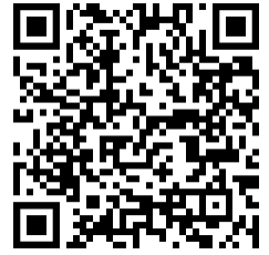
Volunteer Summit Registration

We are so excited to host the inaugural GSCB Volunteer Summit this year on Saturday, August 19, 2023, from 9am – 4:30pm. We're going "Back 2 Basics" for this year's event, which will serve as an opportunity for GSCB Volunteers on all levels to come together to learn about important updates, engage in peer to peer learning and discussions, network with other volunteers, and more! We are finalizing the location details and will communicate that information as soon as possible. Lunch will be provided. Hold your spot by preregistering today! Pre-Register now to hold your spot!