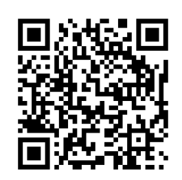
Register for Summer Camp

Spend the summer with us! Check out our <u>current camp staff openings</u>.