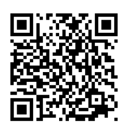
GSCB Join Page

Are there new Girl Scouts interested in joining your troop? Joining now through July 31st with an Extended Year Membership allows them to participate for the rest of this year and next at a reduced price. Learn more at <a href="https://www.gscb.org/join.">www.gscb.org/join.</a>