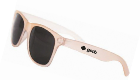
Color Changing Sunglasses $5.00