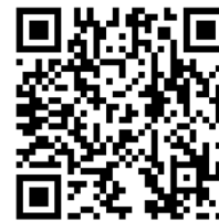
GSCB Events Calendar